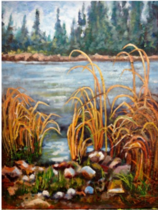
On The Way 11"x 14" Oil $200.00