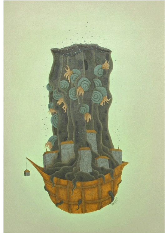
Wandering Tree 27"x 31" Oil on Canvas $300.00