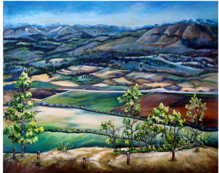
Millarville 30"x 42" Oil $800.00