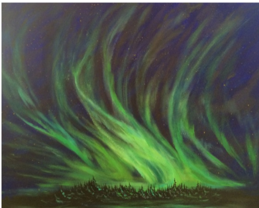
Motion 24"x30" Acrylic $700.00