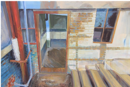
Moving Up in the World II 36"x 24" Acrylic and mixed media on raw canvas $325.00