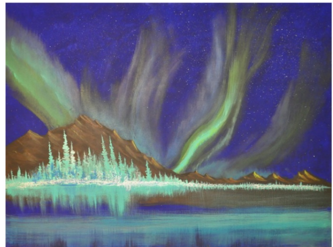
Centennial Piece 30"x40" Acrylic $828.00