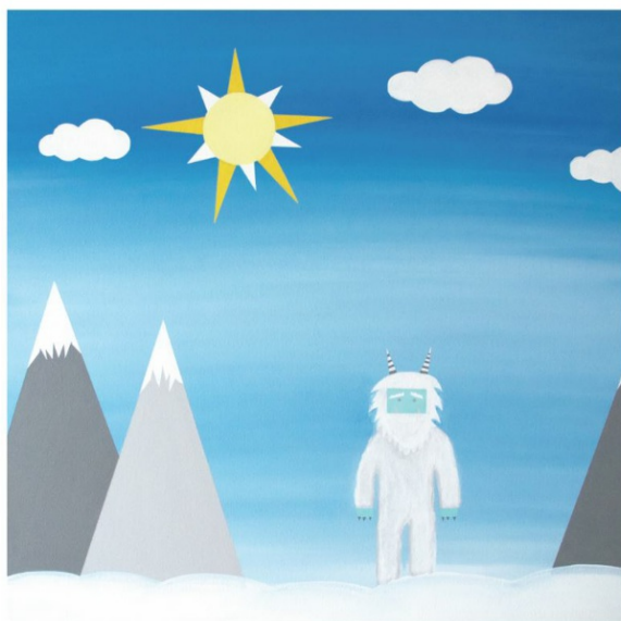
The Great Outdoors 24 x 24" Acrylic on canvas $500.00