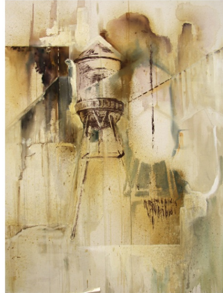
Water Tower 36"x 48" Acrylic, silk screen, & honen on raw canvas $450.00