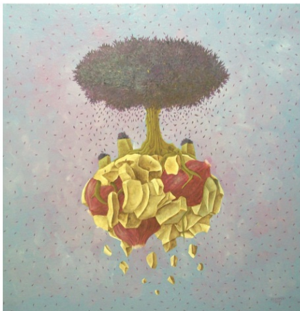
● Travelling with Red Onions 20"x 20" Oil on Canvas $250.00