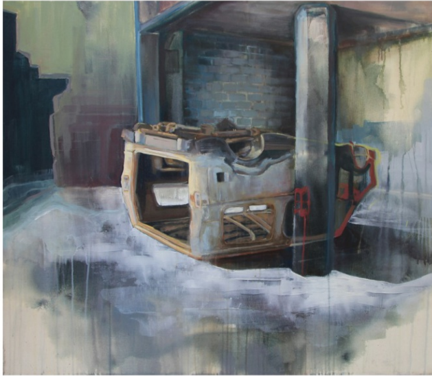
Built Ford Tough 48"x 41" Acrylic on raw canvas $650.00