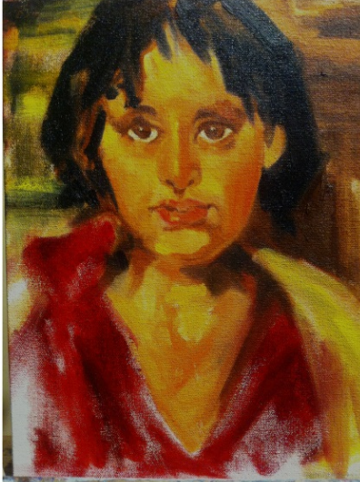
A Child 9"x12" Oil on archival linen $100.00