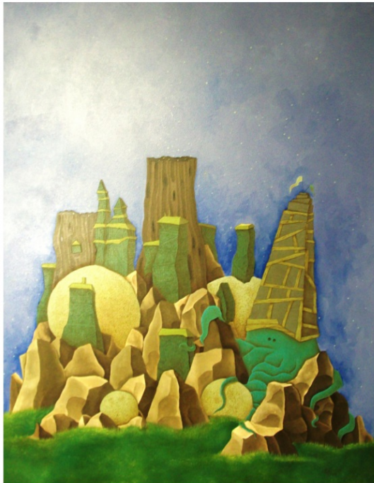
Cantaloupe Village 40"x 45" Oil on Canvas $450.00