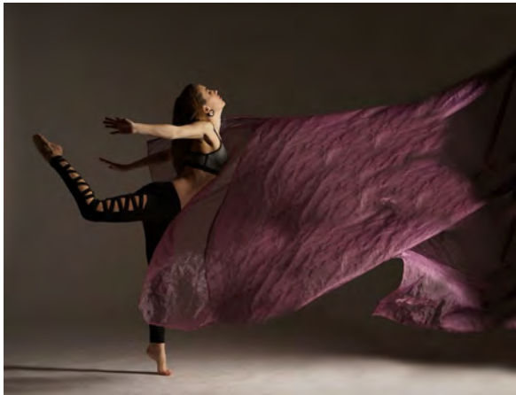
Push + Pull

Recent solo exhibitions include Amiada Rorchachs, Marion Nicoll Gallery and Allied Arts Council. Recent group exhibitions include Show Me Something I Don't Know, U of A Galleries, National Association of Schools of Art and Design Site Visit Exhibition, Alberta College of Art + Design.