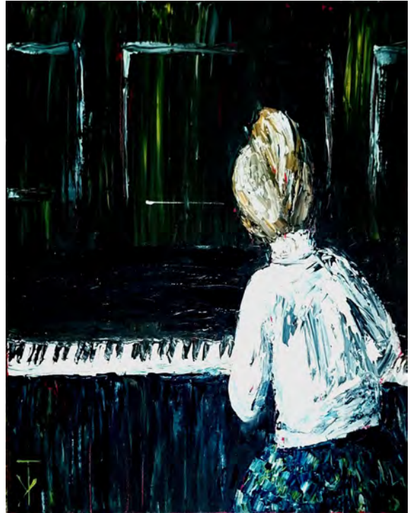
Lost to the World