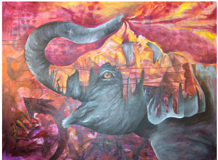
Chaos Within Cleansing Acrylic on Canvas 30" x 40" $500.00