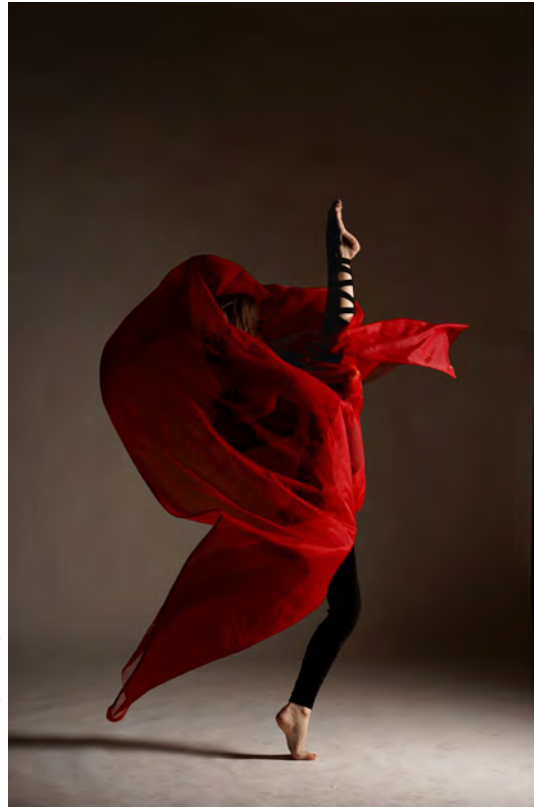
Wrapped in a Rose