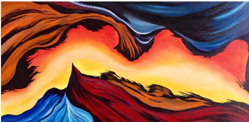
Euphoria Acrylic 12" x 24" $240.00