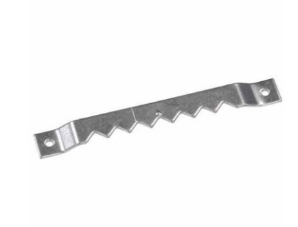
NOT THIS OR THIS!

The Pumphouse Theatre will install the work on behalf of the artists. Artwork may be dropped off or picked up by either the artist or a representative during the hours of 12pm and 6pm on the installation and take down dates provided. Artist must reserve an installation and take down date via a provided online form or by contacting the Programming Director.